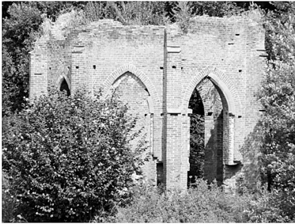
The Gothic Folly, July 2018

The well-defined tiered earthworks of the terraces remain readily recognisable, immediately south of the site of the Hall, and these were the ultimate destination of the visit.