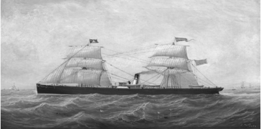
Oil painting of the 'EMMA ASH' steam ship with coastline in the distance. By J. Scott ,1869 [KINCM:1959.43]

-a wide range of items from the costume collections -silver and decorative items from Wilberforce House and Guildhall collections