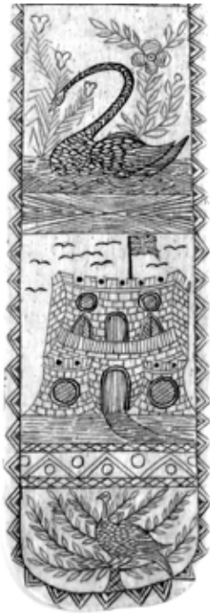
Detail from a decorated stay busk, made from whale jawbone, showing a black swan, a castle and a pheasant in a tree. [KINCM:1978.22]