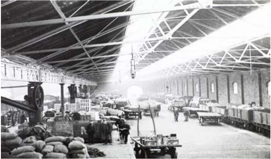
Black and white photograph depicting the goods station interior at Neptune Street [KINCM:2006.16077]

will help with answering enquiries and it will also mean that it will be easier for future displays and exhibitions to feature items from across the service.