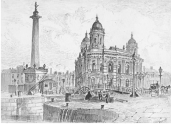
Wilberforce Monument and Dock Offices, showing the old Whitefriargate Bridge c.1885 By F.S. Smith [KINCM:1929.102] (Hull Museums)

As you would expect a number of things have come to light as a result of this work including